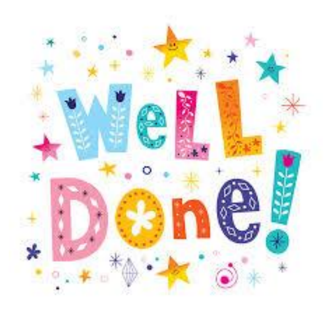
A look into our week at Wharton CE...