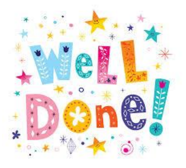
A look into our week at Wharton CE...